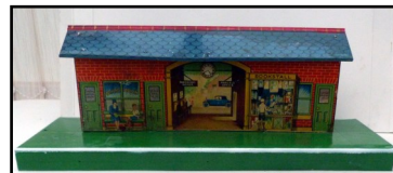
Hornby No. 3 Station (no chimneys or ramps), partially restored