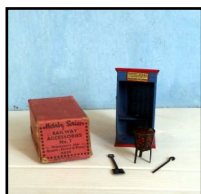
Watchman's Hut with Brazier and Tools. Boxed