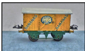
Hornby pre-war Private Owner Van with hinged doors 'Fyffes Bananas'.