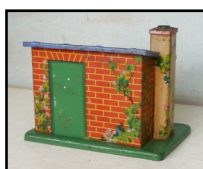
Hornby Platelayer's Hut. Non-hinged door