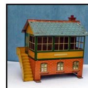
Pre-war No. 2 Signal Cabin, with hinged roof