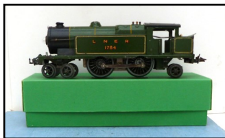
Hornby E220 Special Tank Locomotive, L.N.E.R. No. 1784