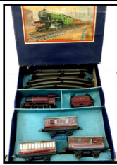
Hornby No. 501 Passenger Train Set L.M.S.