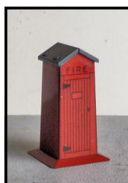
Railway Accessory: 'Platform Fire Hut'