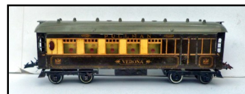
Hornby No. 2-3 Special Pullman Composite Coach 'Verona'.