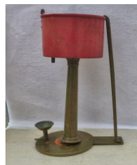
Pre-war No. 2 Water Tank, Complete with ladder and hose