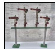
Pre-war No. 1 Signal Gantry 'Home'.