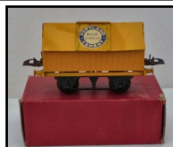
Hornby post-war Cement Wagon 'Portland Blue Circle'