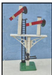
Post-war No. 2 Junction Signal 'Home' (also available as 'Distant')