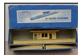
Metal 'D1' Island Platform. In original box with paper label.

For full descriptions and prices, please refer to main sales pages To order any of the above items send an e-mail to: cliff@maddocktoys.com