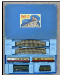
Set EDP11 12v. dc 3-rail Passenger Set B.R. (E) with 'Silver King' loco- motive