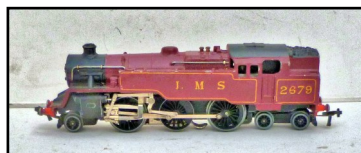
EDL18 12v 3-rail 2-6-4 Tank Loco- motive repainted in L.M.S. maroon