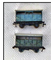
D1 tinplate Cattle Wagons— G.W.R. 4- window apertures