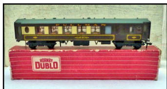
Super-detail Pullman Composite Coach, 2nd. Class 'Car No. 79'. Boxed