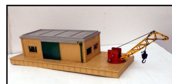
5020 Goods Depot (assembled from Kit)