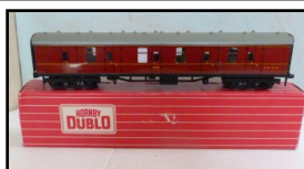
4075 Super-detail Passenger Full Brake Coach. Boxed