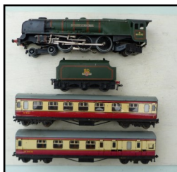
12v. 3-rail Passenger Train Pack with 'Duchess of Montrose' locomotive