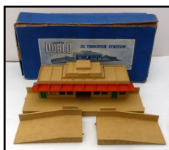
D1 'Through' Station. Boxed