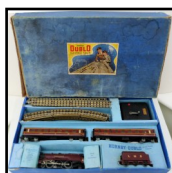
EDP2: 12v. 3-rail Passenger Train Set - L.M.S., with 'Duchess of Atholl' Locomotive