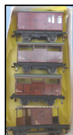
'Livestock Pack'. Comprises BR Horse Box, two B.R Cattle Wagons and Goods Brake Van.