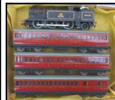
EDP14 'Pack' 12v dc. 3-rail 0-6-2 Tank Locomotive with three D14 Suburban Coaches