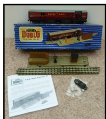
D-1 Travelling Post Office Mail Coach with Lineside Apparatus for pick up and discharge of mail bags.